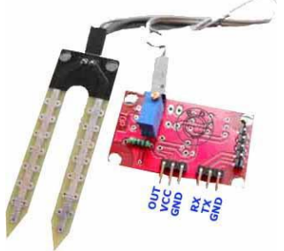
Fig. 4.2 Moisture Sensor

This sensor can be used to test the moisture of soil, when the soil is having water particles, the module output is at high level, else the output is at low level. The operating voltage of this sensor is regulated 5v Dc.